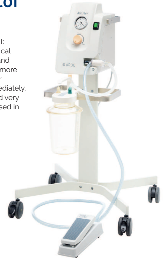
Ardo Master .....