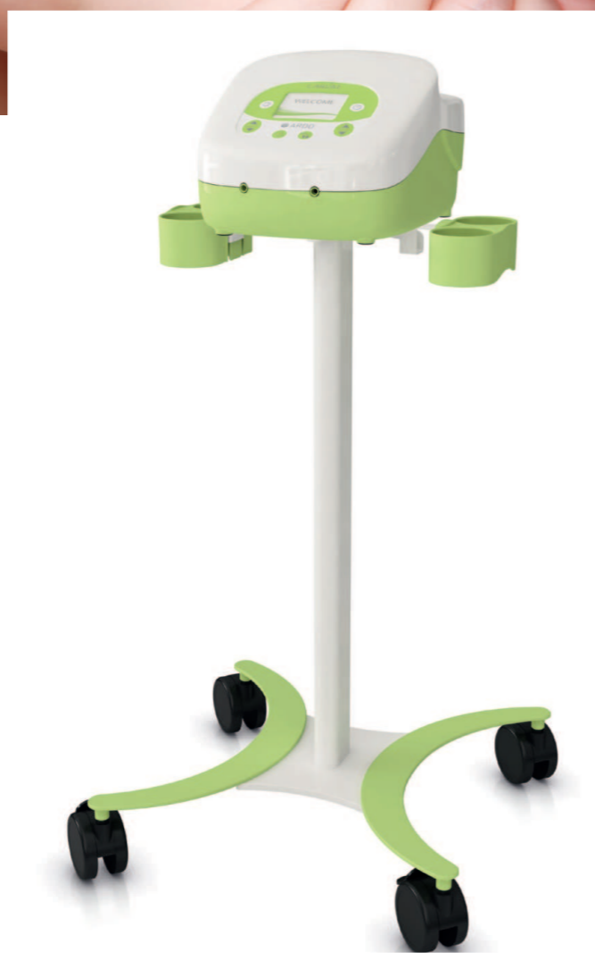
Carum hospital breast pump .....