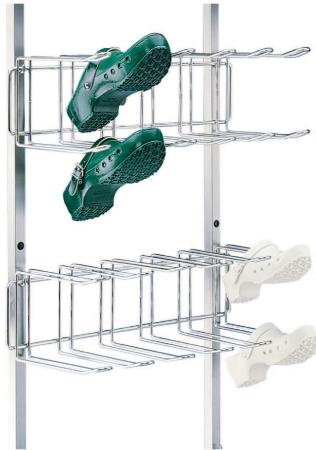
Shelf for 6 pair of theatre-clogs .....

The wire holder (600 mm x 263 mm x 191 mm) is made of electrolytically polished and burr-free stainless steel wire and is attached to a wall hook racks or hook trolleys. There are 6 wire frames on the holder, each for a pair of shoes. Particular emphasis was placed on high hygiene measures and stability in the design. The wire holder weighs 2.375 kg and is therefore easy to attach.