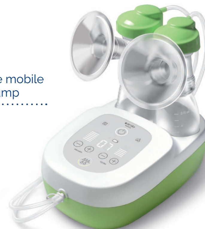
Bellis, the mobile breast pump .....