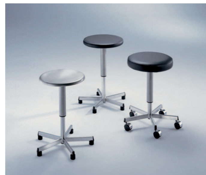
Swivel stool .....