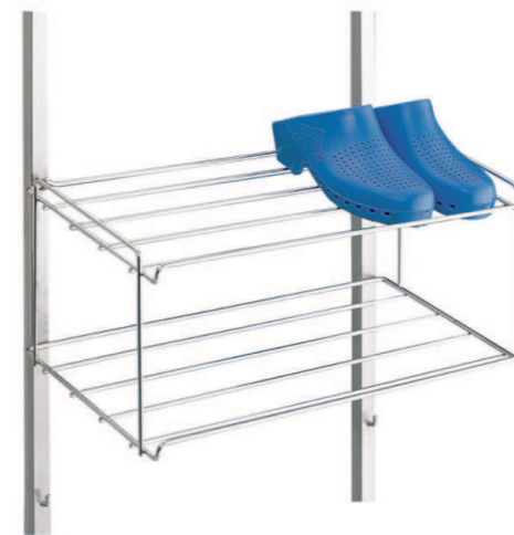
For 6 pair of surgical shoes .....

Up to 6 pair of shoes can be placed on the slightly forward-tilted wall shoe rack. The shelf is made of high-quality, electrolytically polished and burr-free stainless steel wire, which is particularly easy to clean and hygienic. The 1.851 kg shelf is attached to wall hook rails or a hook wall, which makes it particularly stable. The size of the shelf is 600 mm x 320 mm x 234 mm.