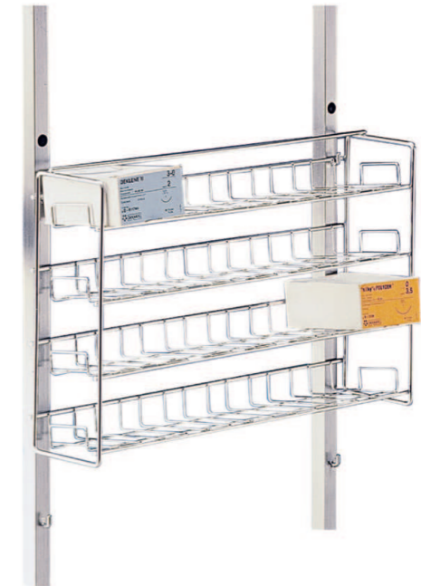
Shelf for sutures

The sturdy wall rail rack is suitable for storing suture material in commercially available small packs. The frame is made of high-quality electrolytically polished and burr-free stainless steel. With a weight of 2.23 kg, it can be easily mounted on wall hook rails or hook trolleys. The shelf measures 604 mm x 138 mm x 371 mm.