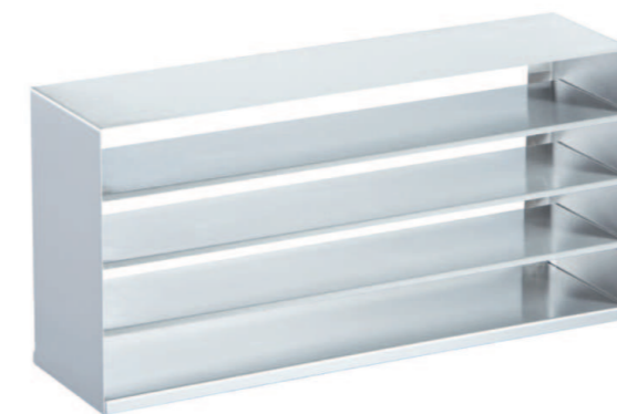
For the storage of suture materials