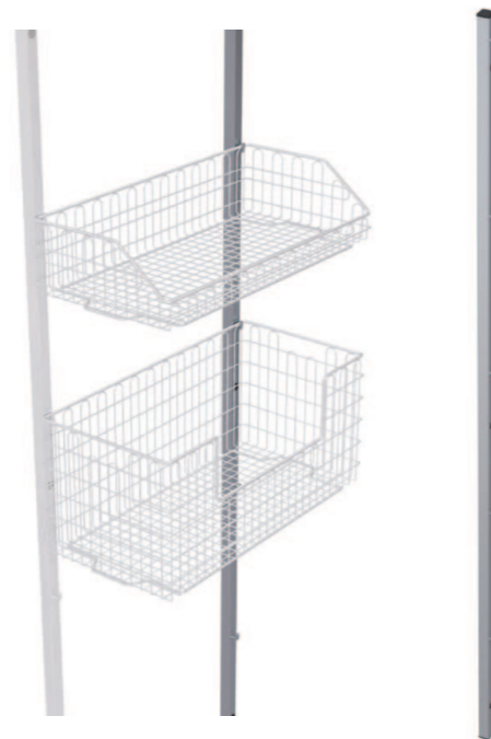
For attaching stainless steel racks and sterile goods baskets