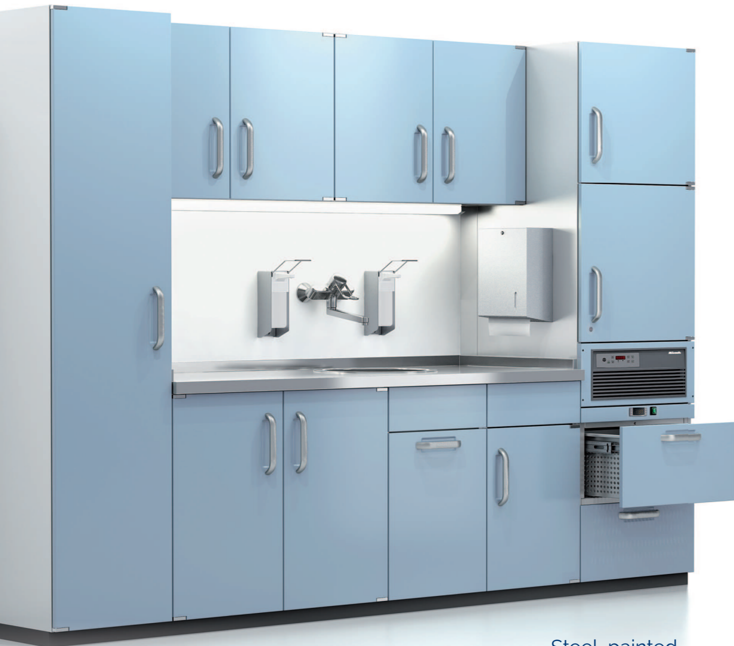
Steel, painted, 1800 mm wide .....