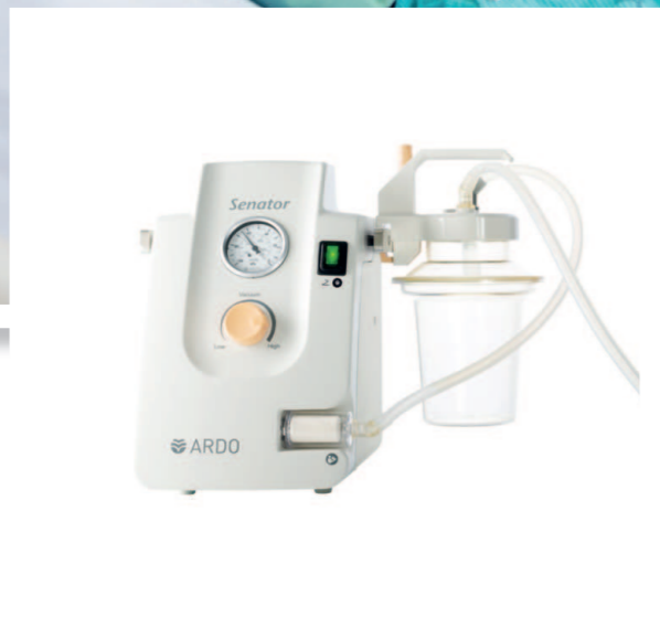
Ardo Senator .....