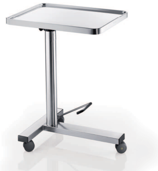
Hydraulic instrument table .....

The practical mayo instrument table, easily height-adjustable using a foot pedal. Heavy 3-foot design with tip safety and installed precision pump (closed hydraulic system, max. load 30 kg, maintenance-free, immediately ready for operation) for height adjustment from 950–1350 mm with foot pedal operation, frame construction and lifting column made of stainless steel. Step bar provided with electrically-conductive rubber protection. Sturdy, seamless deep-drawn table top made of stainless steel, with rounded corners and edges, can be rotated and locked. Abrasion-resistant, non-discolouring corrosion-resistant synthetic double castors, 1 is electrically conductive (3 steering castors dia. 75 mm).